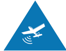
AEROSPACE & DEFENSE